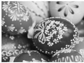
Annual Easter Egg Hunt on Easter Sunday, April 9th at 10 am